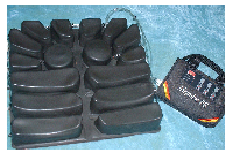
Airpulse PK A Mobile Solution For Pressure Sores

As the floor plans were nearing completion, we contacted national product manufacturers to discuss their willingness to partner with us. A very interested set of initial sponsors offered their products and services to the home.