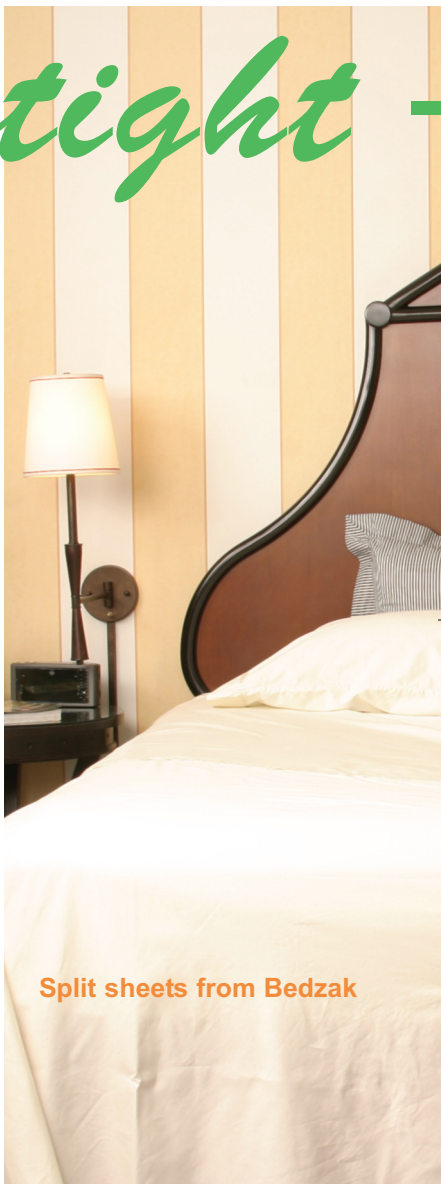
Split sheets from Bedzak

For the base of our bed, we selected the Leggett & Platt Lifestyles S-cape