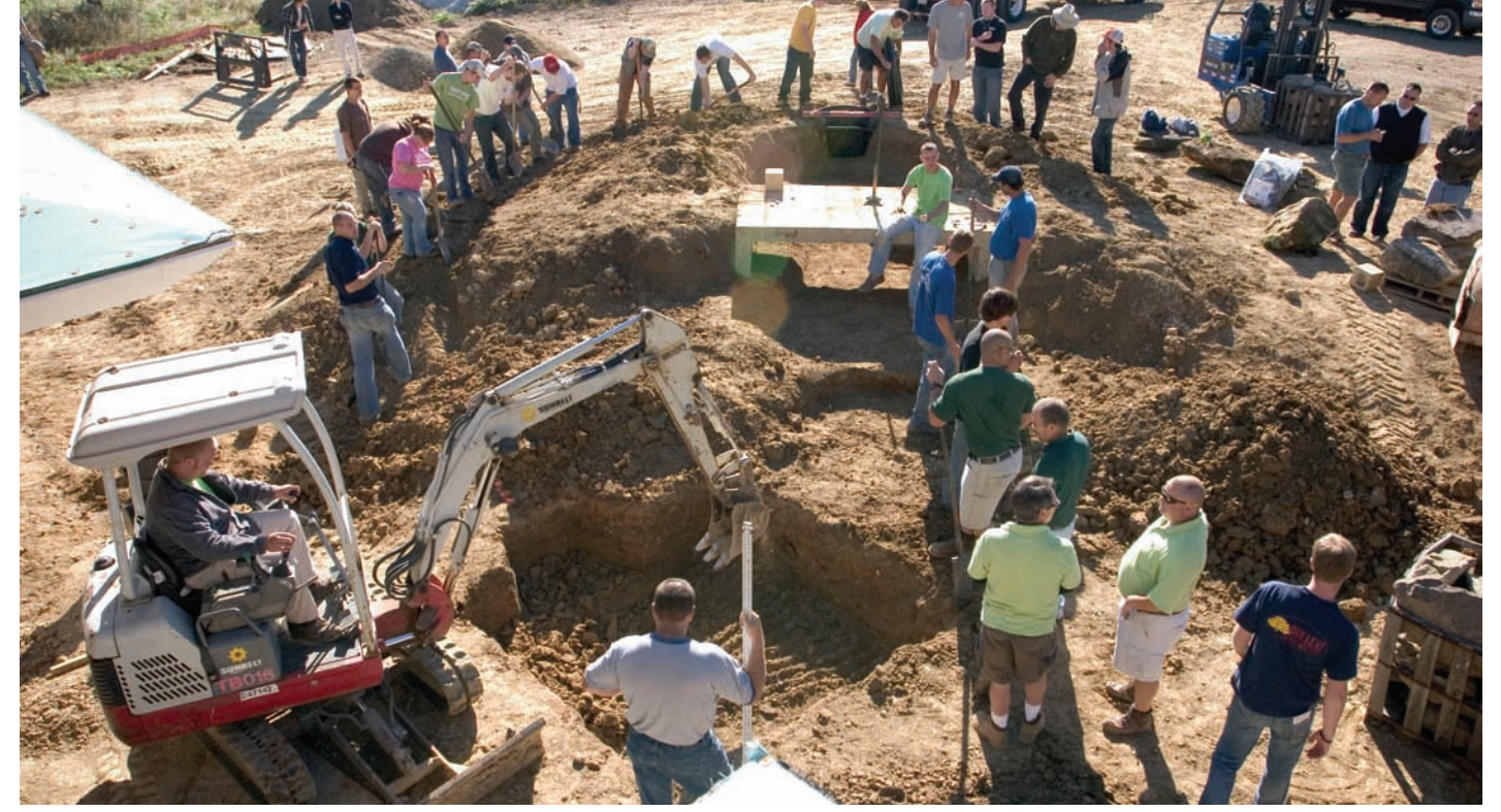
Aquascape, Inc., led the design and installation of the rainwater harvesting system, complete with a 20-foot stream and a four-tiered waterfall. Hocking College students and certified Aquascape contractors completed the project in one day, courtesy of 50 dedicated volunteers.