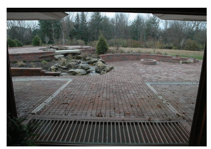
From the great room window, there is an expansive grand view of the paver patio, retaining walls, waterfall, fire pit, lawn and landscape plants. The paver upper deck is accessed by a gently sloping 4-foot-wide paver pathway.

The Universal Design Living Laboratory was built as a national demonstration home and garden using universal design and green building principles. Here's the story of this unique space.