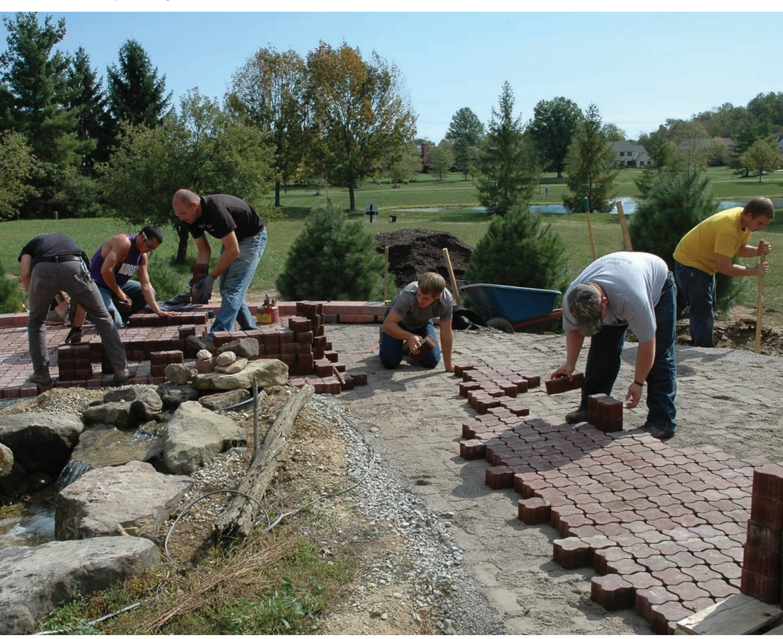
Hocking College students installed pavers on the upper deck. Students worked at the Universal Design Living Laboratory on several occasions.

drew the landscape plan. We brought in horticulturist Tracy DiSabato-Aust of Horticultural Classics and Consultations to design the front landscape beds.